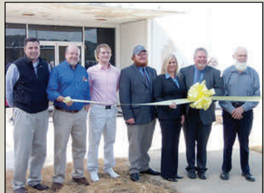
Ribbon cutting for Taylor Manufacturing in Stevenson