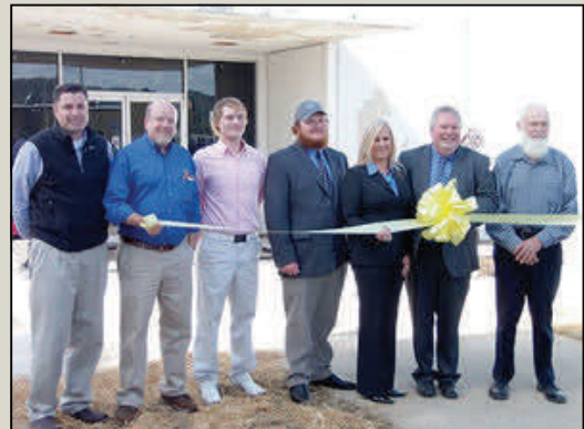
Ribbon cutting for Taylor Manufacturing in Stevenson